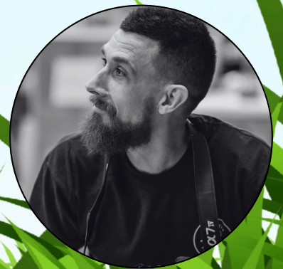
WILL GREEN SHOW PHOTOGRAPHER