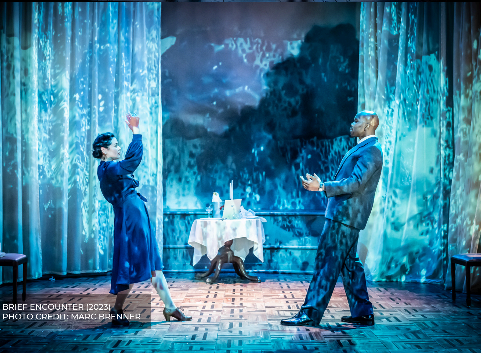
BRIEF ENCOUNTER (2023)