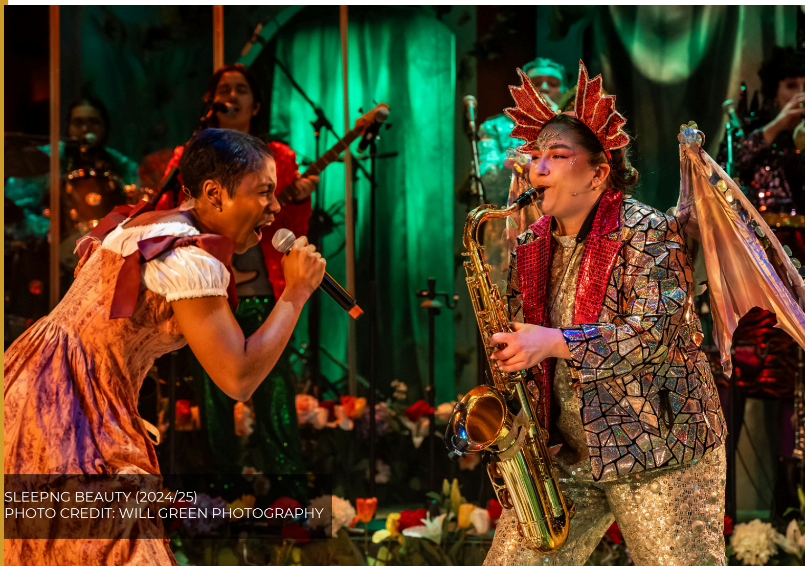
SLEEPING BEAUTY (2024/25)

We in the process of cultivating exciting projects and co-productions with new UK and international partners for 2025 and beyond.