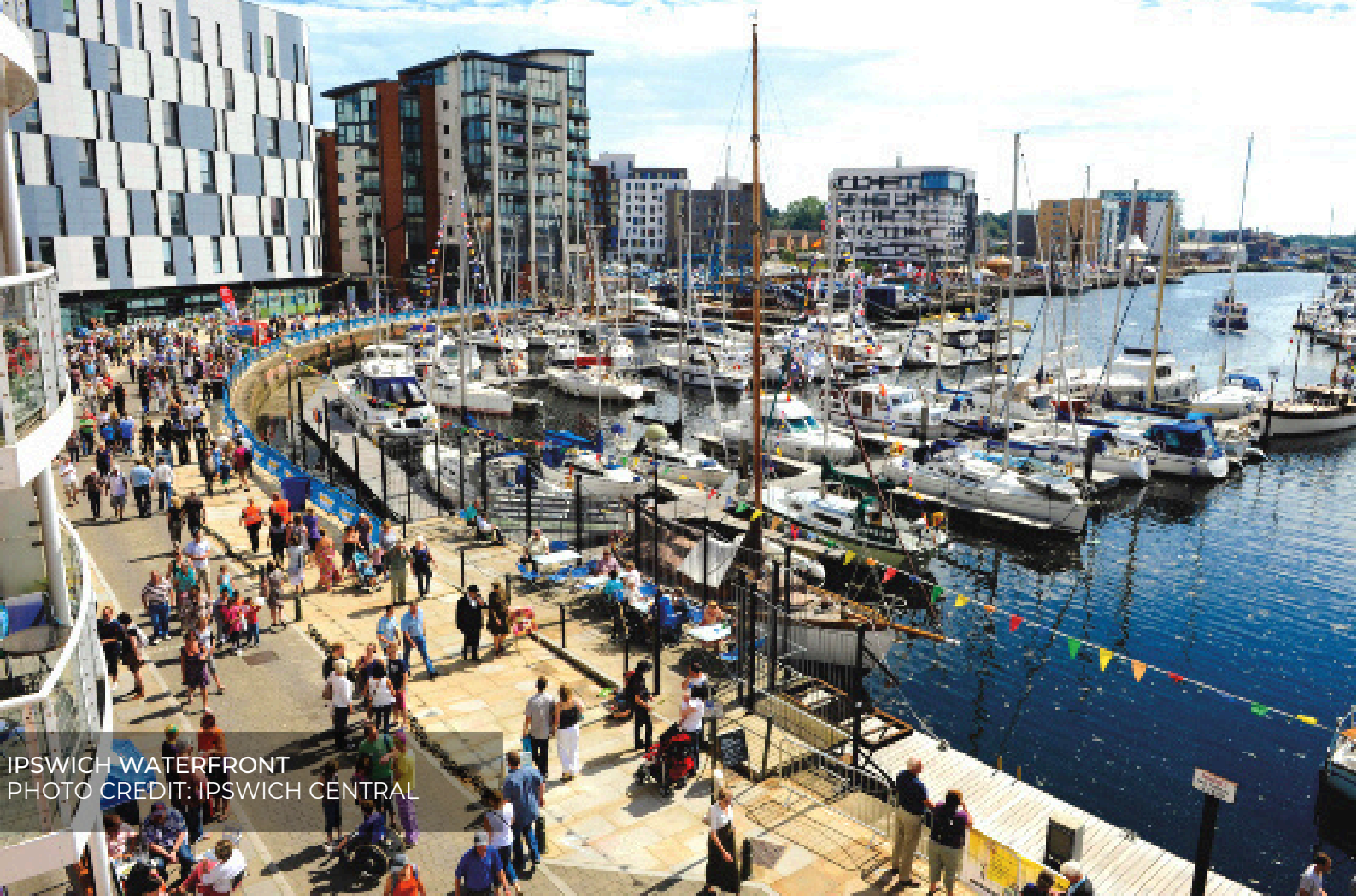
IPSWICH WATERFRONT