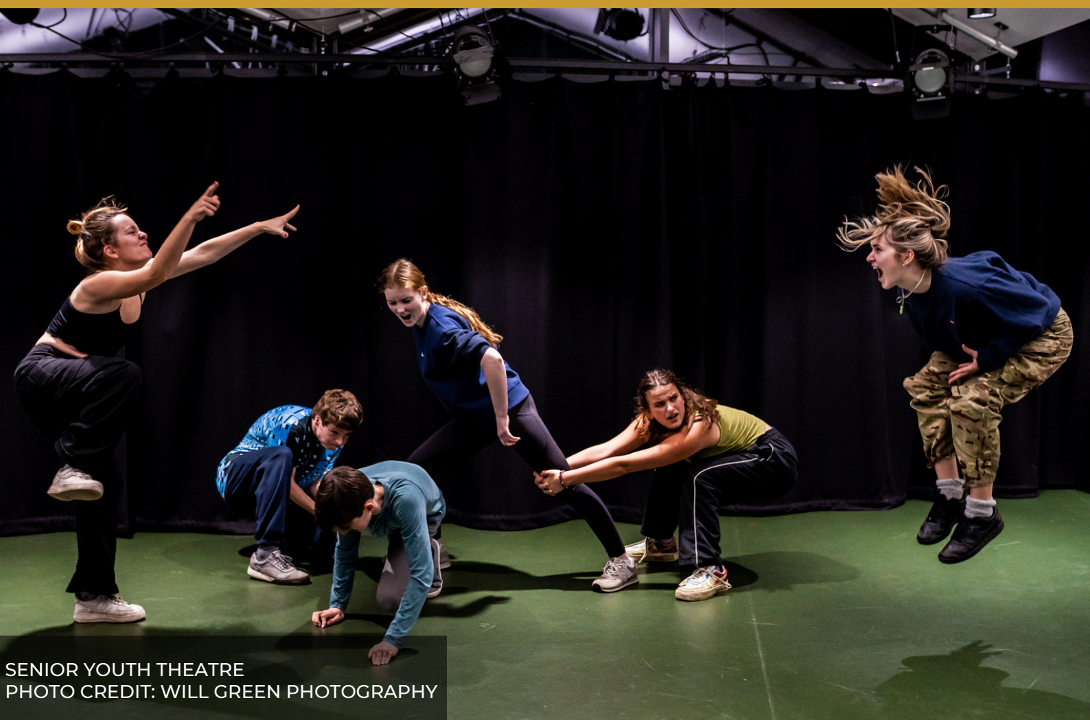
SENIOR YOUTH THEATRE