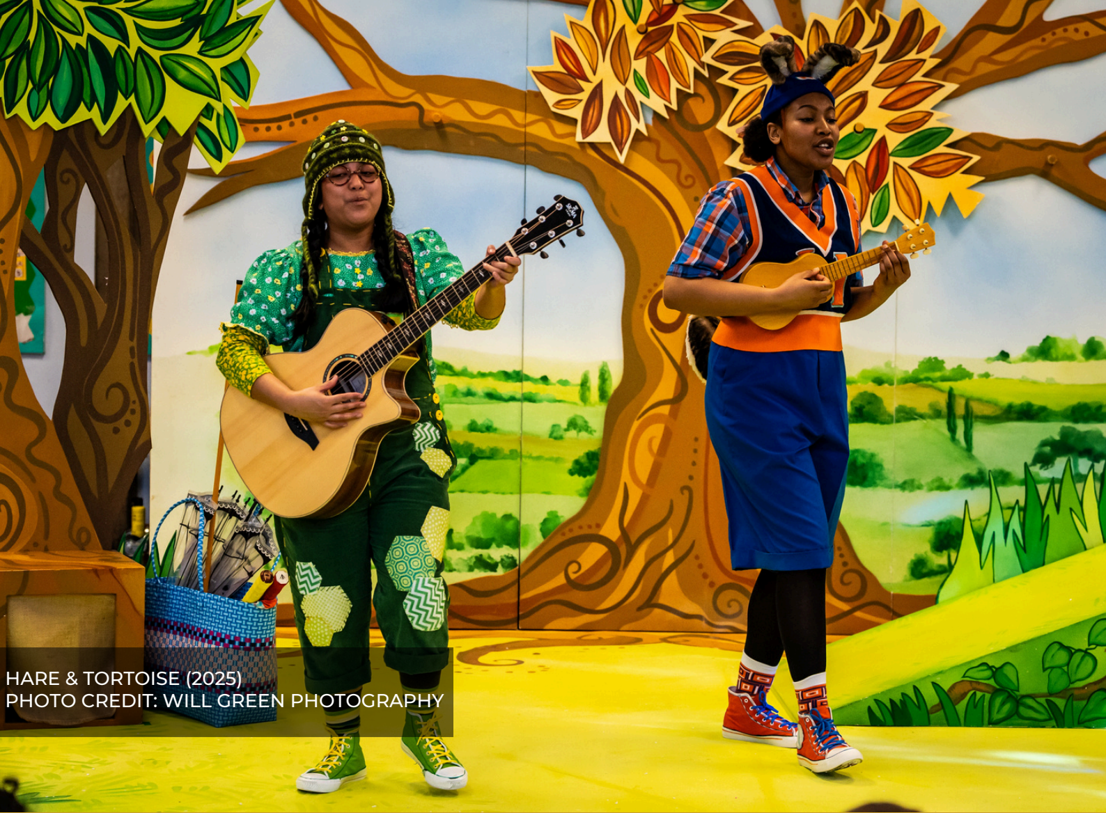
HARE & TORTOISE (2025)