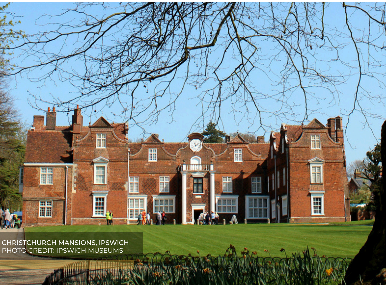
CHRISTCHURCH MANSIONS, IPSWICH