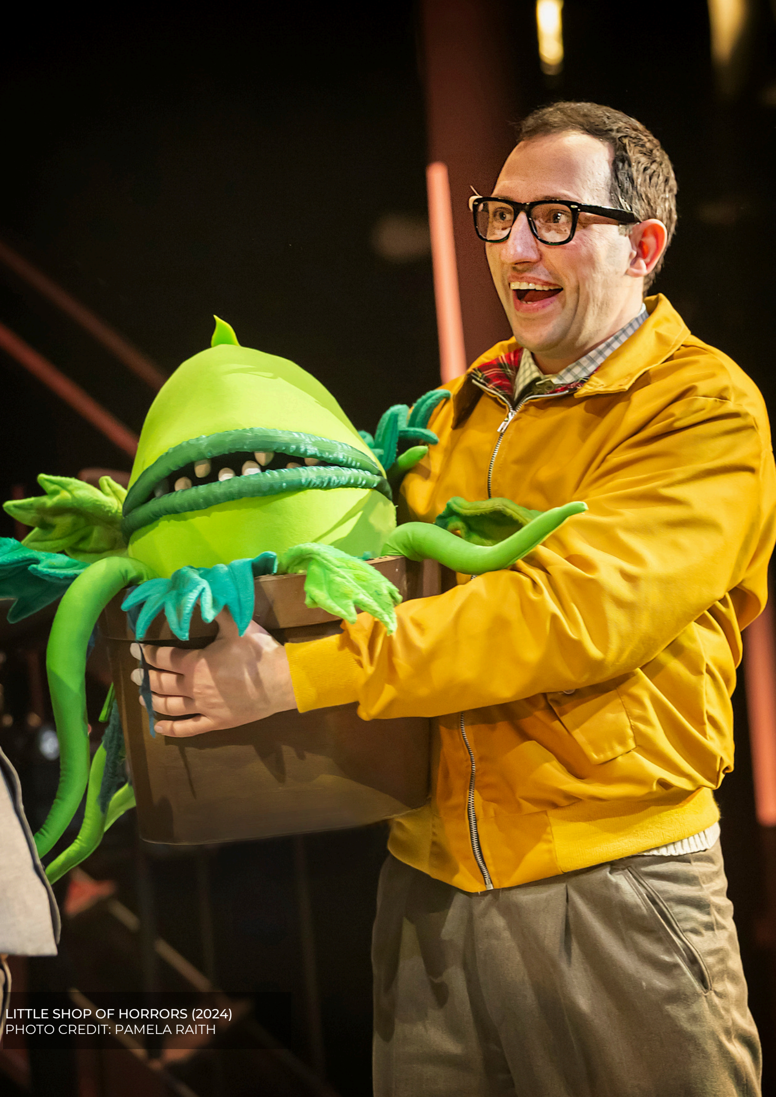
LITTLE SHOP OF HORRORS (2024)