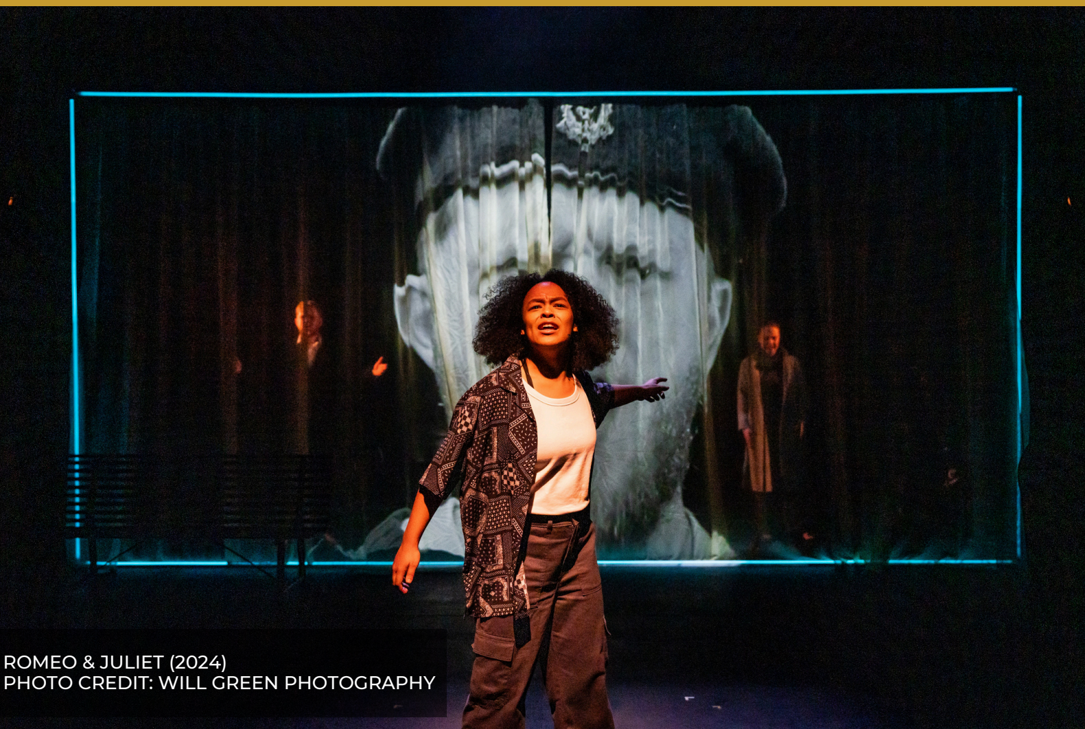
ROMEO & JULIET (2024)