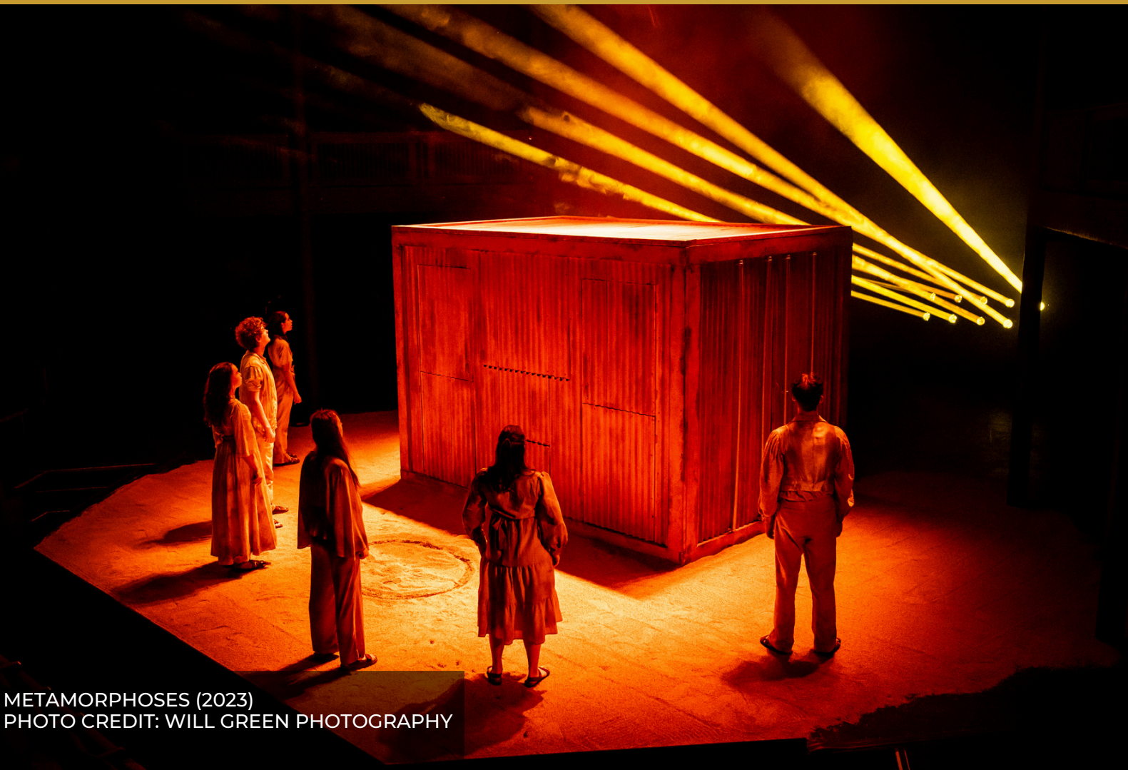
METAMORPHOSES (2023)