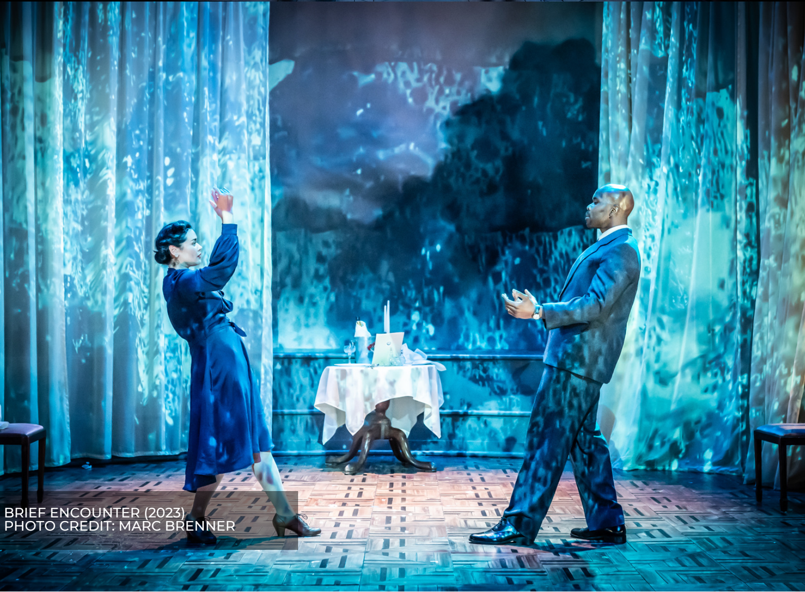
BRIEF ENCOUNTER (2023)