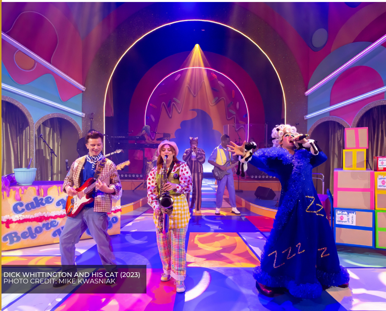
DICK WHITTINGTON AND HIS CAT (2023)

We in the process of cultivating exciting projects and co-productions with new UK and international partners for 2025 and beyond.