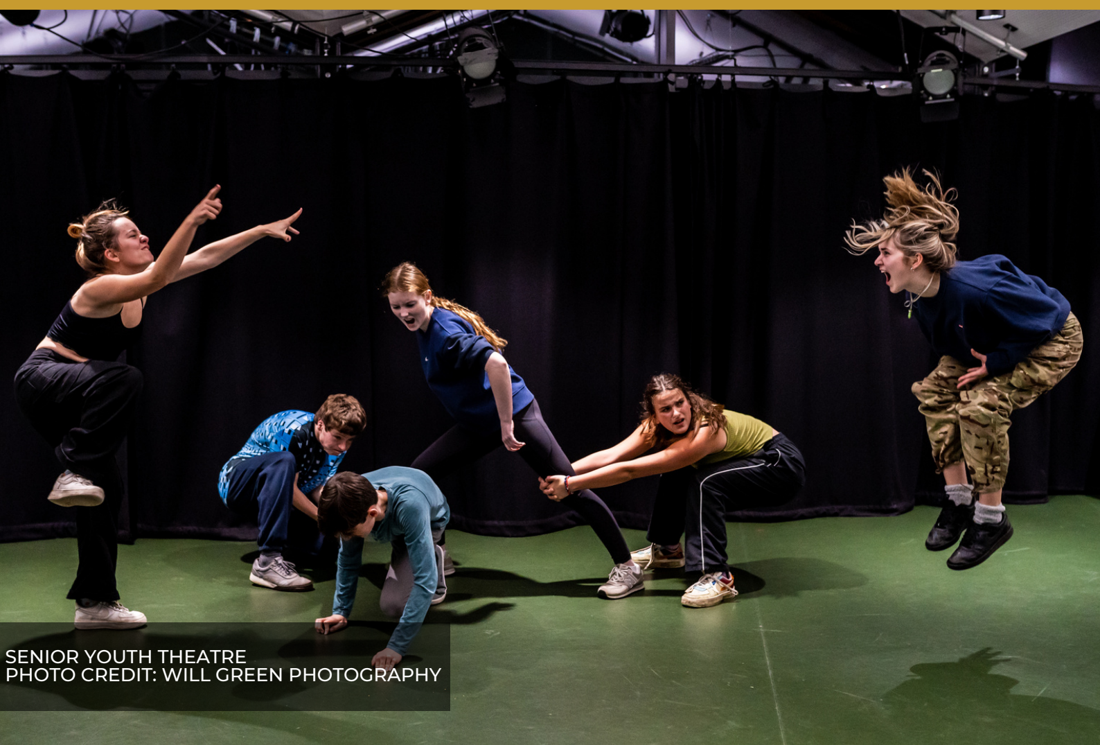
SENIOR YOUTH THEATRE