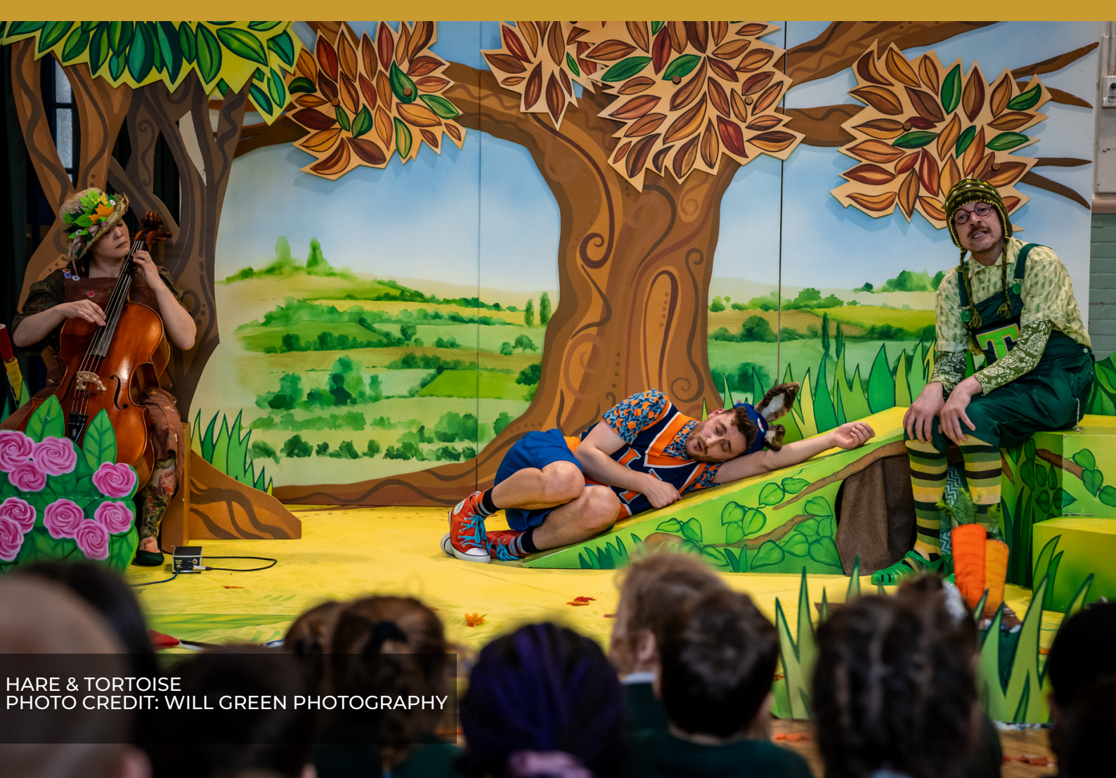
HARE & TORTOISE