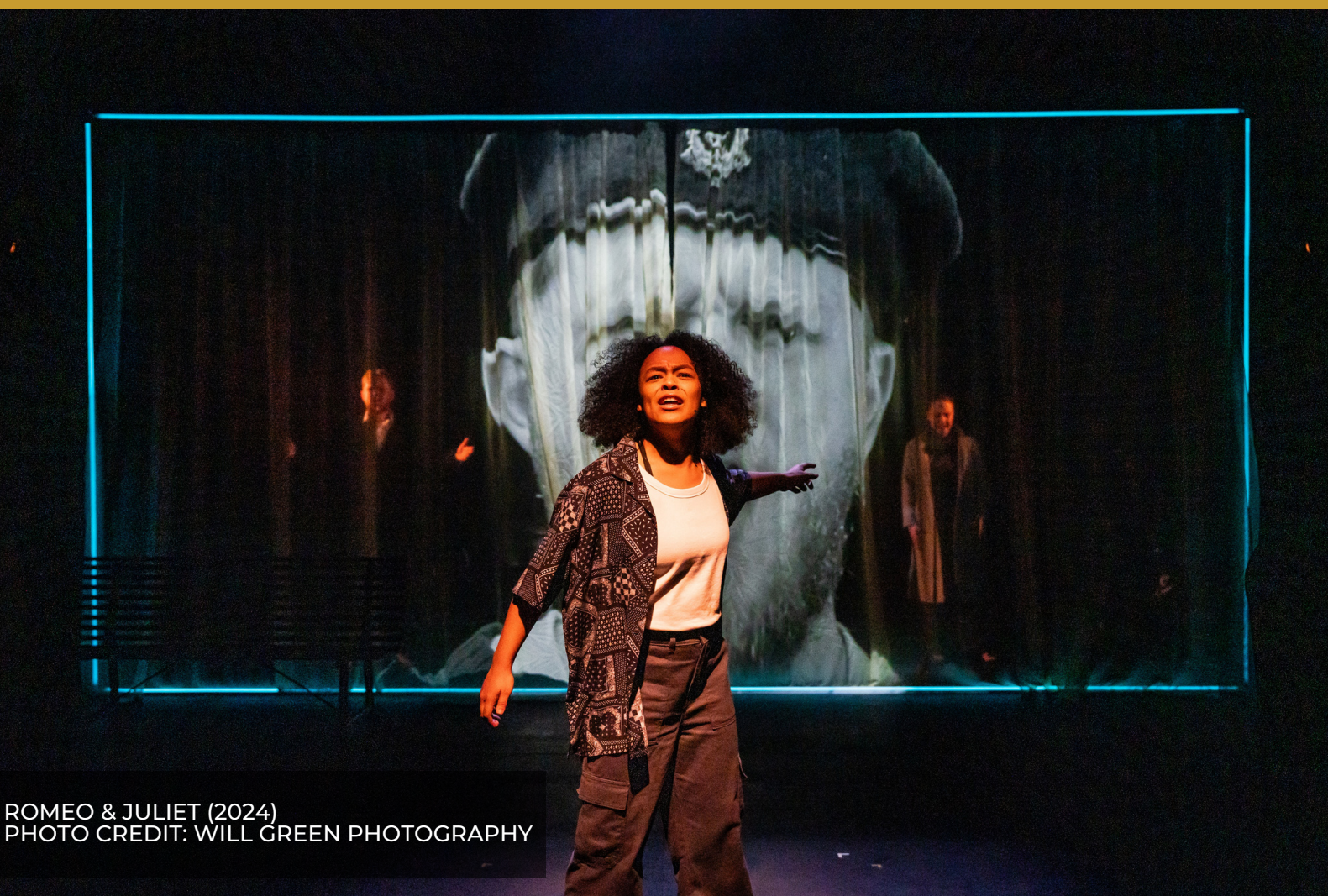
ROMEO & JULIET (2024)